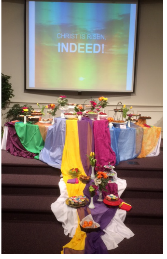
After a season of Lent focusing on "Blessed Hunger," all were invited to join in the "Holy Feast" during the Easter service to celebrate Jesus' resurrection.