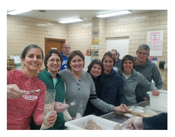
Gelassenheit women show off the lovely hair apparel worn while filling soup and cookie bags at Soup of Success in December.

Thank you so much for the donations to the school. The school would not be able to run without the generous support we receive from people like you. God bless you and we will be praying for you.