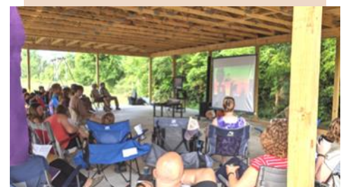
Worship Service in the pavilion