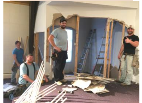
Demolition of visuals closet