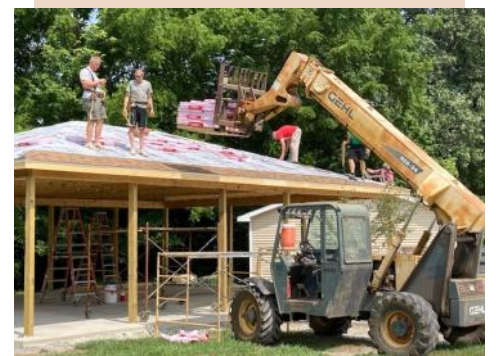
Roofing the pavilion