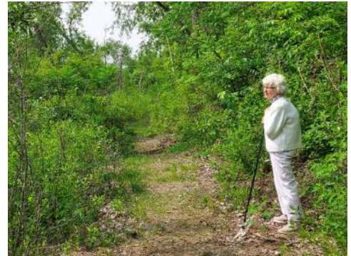
Outside Spiritual Practices