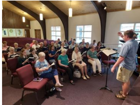
New Songs from Voices Together