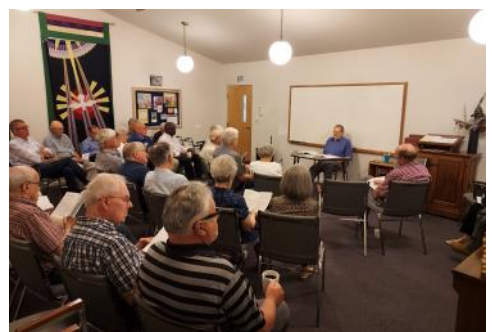
Salt & Light Bible Study