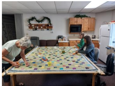
Comforter Knotting / Prayer Shawls