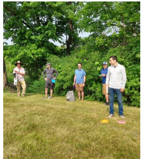
Active Outside Activities