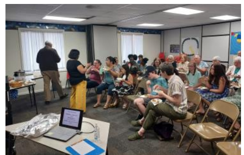
Foods from around the World