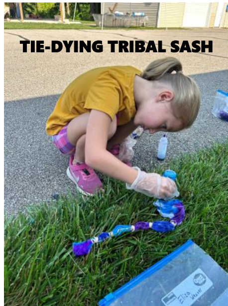
TIE-DYING TRIBAL SASH

Waterford hosted 29 children last week for Bible School. Designed to give children a glimpse of life during the time of Jesus, the activities included worship, drama, and outdoor "market" stalls, complete with Roman soldiers!