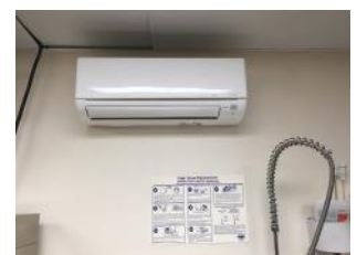
c) Air conditioner