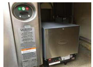
a) Booster heater

dishwasher. If you are working in the kitchen, please take the time to read through all the instructions and familiarize yourself with the start up and shut down procedures for the equipment as some of the procedures have changed. Also, remember that there are no garbage disposals in any of the sinks, so to avoid nasty clogged drains, food waste should be scraped into the trash can before dishes are rinsed in the sinks. Thank you for helping us keep our kitchen functioning smoothly.