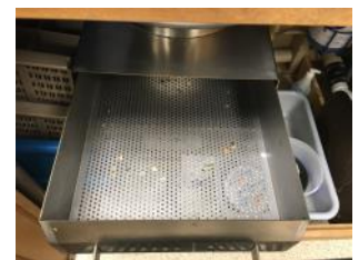
b) Food waste drawer