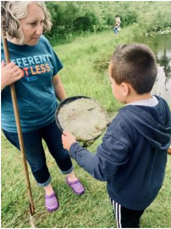
Using nets to collect macro-invertebrates