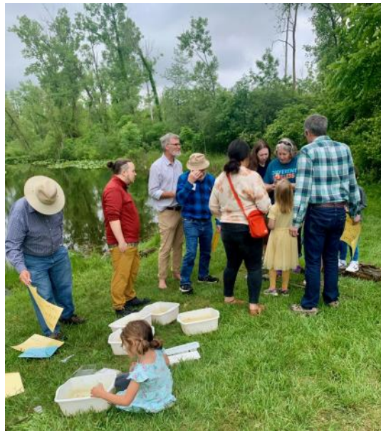
Taking a closer look