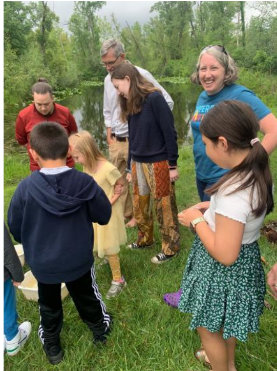
Will the frog jump out of the tub?