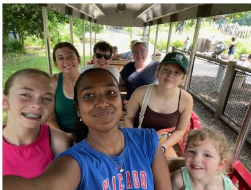
Enjoying a train ride.

On Saturday, June 21, the first day of the heat wave, 30 WMcer's, ranging in age from 3-88, braved the weather and met at the Potawatomi Zoo in South Bend.