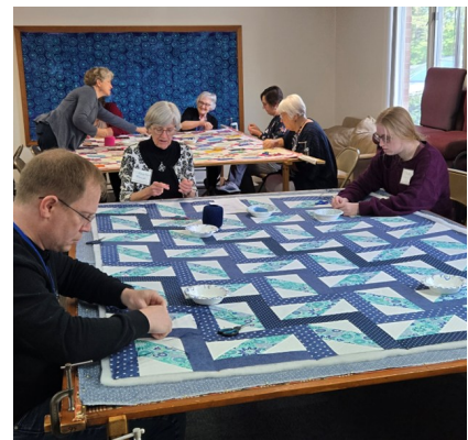
Jigsaw Puzzles and Comforter Knotting electives in 2025.