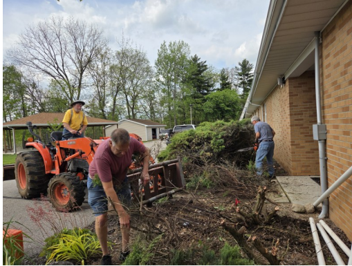
They cut off branches of seven shrubs,

On May 16, the Pathfinders class put on their work gloves, pulled out their power tools and a tractor and took out their frustrations on the large shrubs on the west side of the church encroaching on the entry to the west door.