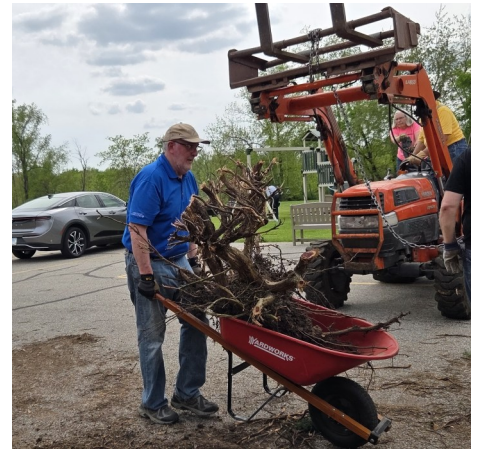
hauled away the debris.