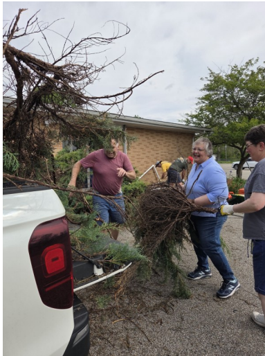
loaded up and