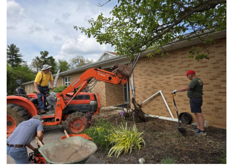
pulled out the stumps,